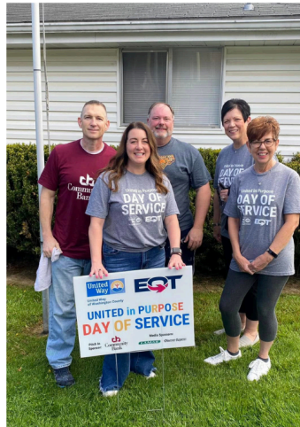
Hygiene Kit Donations